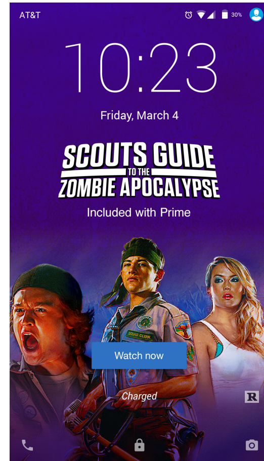
Final approved design

The layered asset had the title and border layered, but unfortunately not the characters.