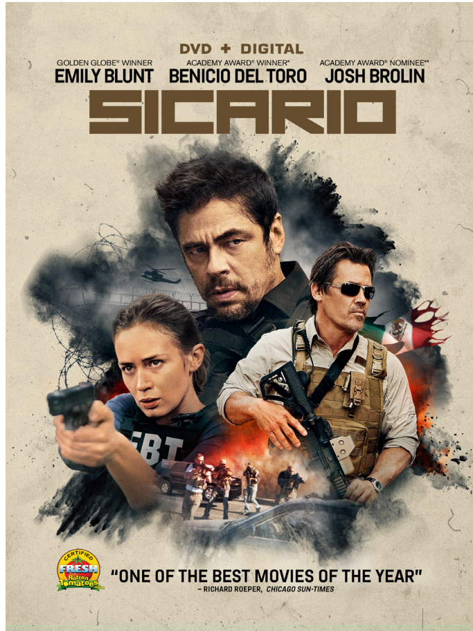
Fully layered PSD studio asset